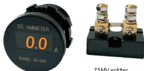
SF50870 OLED Ammeter, with 75mv spltter (0~100A)