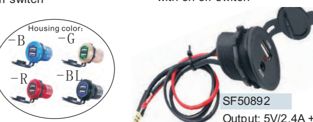
SF50892 Output: 5V/2.4A +AUX