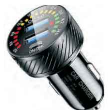
SF50969 Car charger QC 3.0+Voltmeter