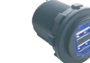
SF50799 Output: 5V/4.8A (2.4A max each port)