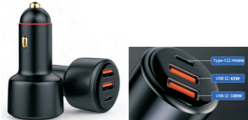
SF50982 Triple USB port PD 36W+65W+100W USB Type C QC3.0 Usb1: 5V-12V/5A(65W) Usb2: 5V-20V/5A(100W)