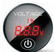
SF51790 Battery Capacity VoltMeter Input: 5~48V with touch switch Measuring range: % Blue/red/green led for choice