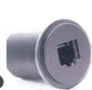
SF51898-1 RJ45 Microphone Outlet