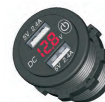
Dual USB with touch switch With voltmeter