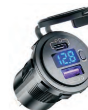
SF51907 QC3.0+PD dual USB & Volt.meter with on-off switch