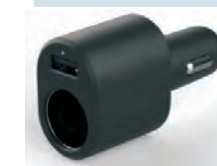
SF51933 Single power outlet with single usb