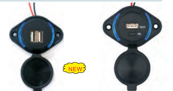
Flat USB panel size: 63.7*47.8*18.1mm