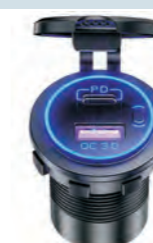
SF51906 QC3.0+PD dual USB with on-off switch