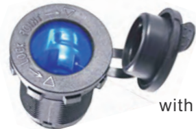
SF50780(B) Power socket with Blue Led