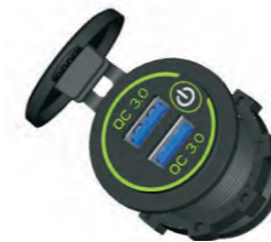
Dual USB with touch switch