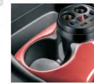
SF51933 Single power outlet with dual usb & Type C