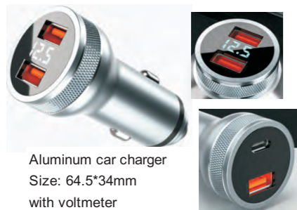
Aluminum car charger Size: 64.5*34mm with voltmeter