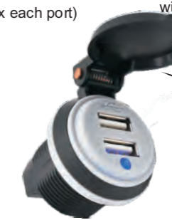
SF50789 (S) Output: 5V/4.8A (2.4A max each port)