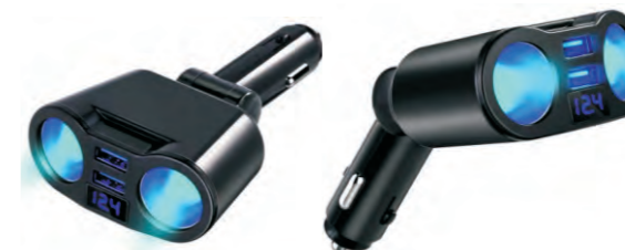
SF51929 Dual power outlet with dual usb With volt. display Adjustable direction