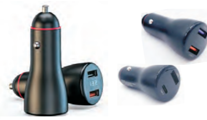
Super quick charge USB charger With Voltmeter, Aluminum housing