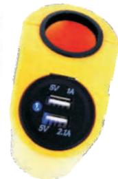
Mounting panel for USB (for bus rail 32mm/35mm) SF-BS26-32MM/35MM

USB not included, you may choose from our USB series