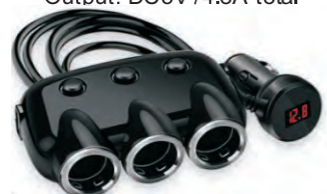
SF50954 USB charger with 3 power sockets & voltmeter with 2.1A & 1A USB port