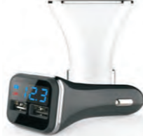
SF50919 2port USB Charger with LED volt.&amp; Display Input voltage: DC 12-24V Output: DC5V /4.8A total