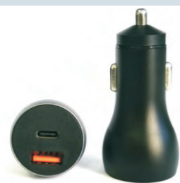
SF50961 Aluminum Car charger Qc 3.0+ PD type C Input:9V-30V total Output:36W, Size:66*30*30mm