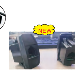
SF51945 Switch size RJ45 socket.

Snap-in type USB Input: 12-30V Output: 5V 2.1A (total) or 4.2A for choice Led indicator light: Blue or without Wire 150mm, AWG 18#