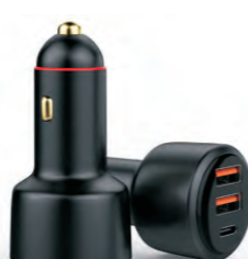
SF50983 Triple USB port PD 36W+65W+65W USB Type C QC3.0 Usb1: 5V-12V/5A(65W) Usb2: 5V-12V/5A(65W)