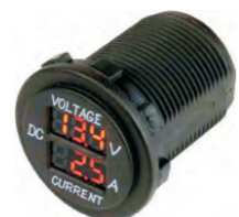
SF50792 Dual Volt.&Amp.: 5~30V, 0~10A