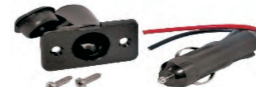
SF50403-22SP Power Plug 10AMP & Socket 12 Volt