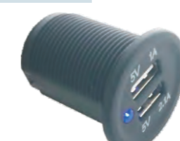
SF50782 Output: 5V/3.1A totally