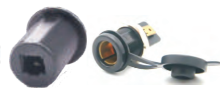
SF50881 Merit socket (small)