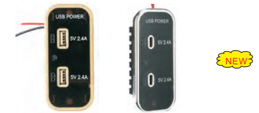
Flat USB panel size: 89*41*21mm