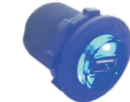
SF50795 Output:5V 2.4A