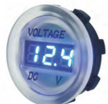
SF51791 Voltmeter Input: 5~48V