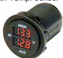
SF50889 Dual Voltmeter: 10~60V