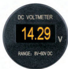
SF50872 OLED Voltmeter: Measuring range:8~60V