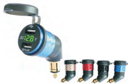
Dual USB charger & voltmeter, merit type 7075 aluminum alloy housing SF CODE output Housing Color choice SF51132 4.2A Golden/blue/black/red