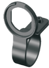
SF-BS25 One Hole Hand Stent