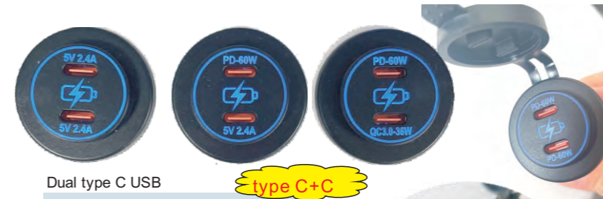
Dual type C USB