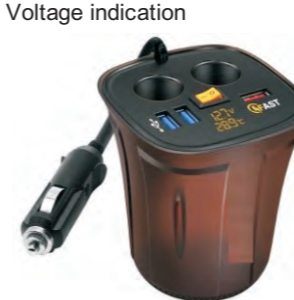
Dual power outlet with switch SF NO. Details SF51985-1 dual USB +QC3.0+Volt. & Temp meter SF51985-2 dual USB +QC3.0+Volt. meter