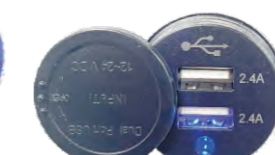
SF51887 Output: 5V 4.8A with special cover