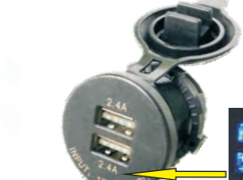
SF50874 Output: 5V/4.8A (2.4A max each port)