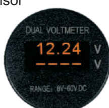
SF51882 OLED dual Volt. Meter Measuring range:8~60V DC