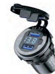
7075 aluminum Dual USB With voltmeter , with touch switch NEW