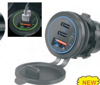
SF51954 Triple port USB QC3.0+dual PD, with switch NEW