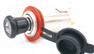
SF50784 Cigarette socket