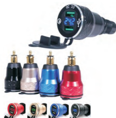
Dual USB charger & voltmeter, merit type 7075 aluminum alloy housing SF CODE output Housing Color choice SF51130 4.2A Golden/blue/black/red SF51131 QC3.0 Golden/blue/black/red