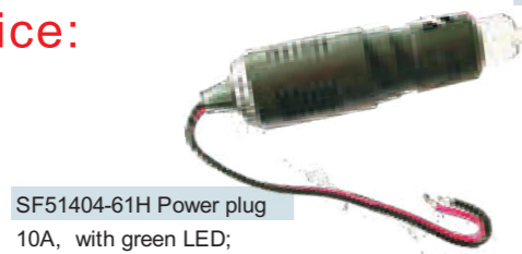
SF51404-61H Power plug 10A, with green LED; With 6"/15cm wire pig tail (20AWG wire)