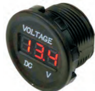
SF50786 Voltmeter: Measuring range: 5~30V