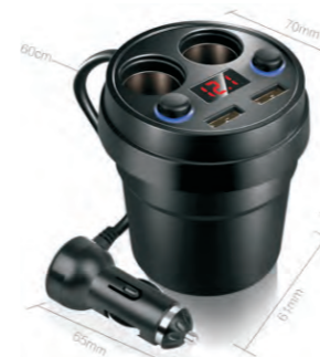
SF50984 Dual power outlet with 3.1A dual USB port With switch to control each USB port Voltage indication