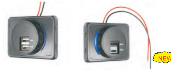
Flat USB panel size: 89*50.1*18.1mm