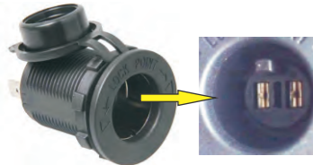
SF50794 Engle socket