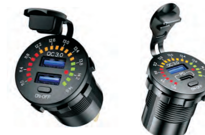
Dual USB & Volt.meter, with on-off switch