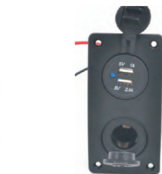
SF50890-1U1P 3.1A USB+Power Socket