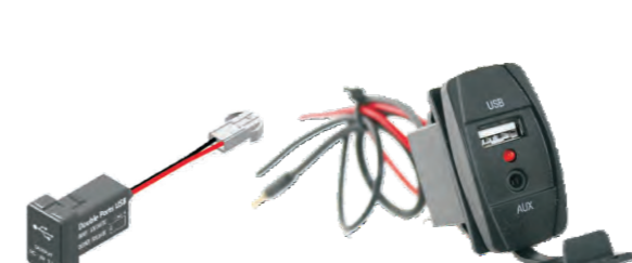
SF50885 TOYATA USB Input: DC12V/24V Output: DC5V 3.1A totally

European style Cigarette lighter 12V 0-150W SF NO. Lighting SF51982-R Red led SF51982-B Blue led SF51982-G Green led SF51982-O Orange led