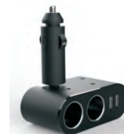
SF51934 Dual power outlet with dual usb