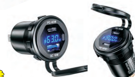
7075 Aluminum USB With voltage& power display NEW