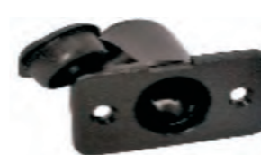
SF50403-22 Auto cigarette socket