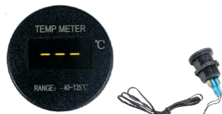
SF50871 OLED Temp. meter Mesuring range:-40~120°C With sensor