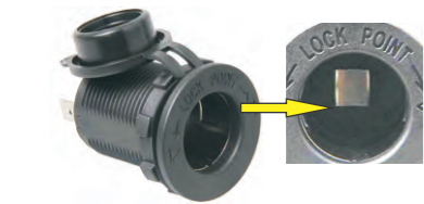
SF50780 Power socket