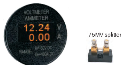
SF51885 OLED Volt.&Amp Meter Measuring range: 8~60V,0~100A DC