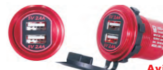
SF50628/ 50629/ 50630