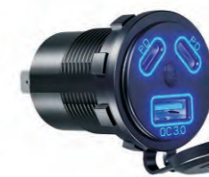
Triple port USB With switch NEW