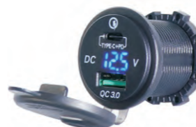
SF51901 USB QC3.0 & Voltmeter with TYPE-C+PD 5V-3A 9V-3A 12V2.5A 15V-2A 20V-1.5A