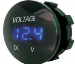
SF51792 Voltmeter Input: 5~48V

Blue/red/green/white/orange led for choice