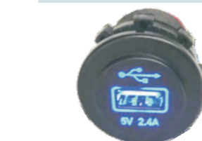
SF50795S Output: 5V/2.4A max