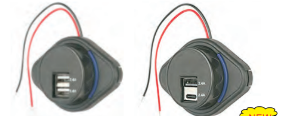
Flat USB panel size: 89*50.1*18.1mm