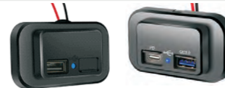
Flat USB panel size: 66.5*39*15.5mm