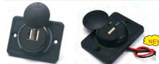
Flat USB panel size: 63.7*47.8*18.1mm