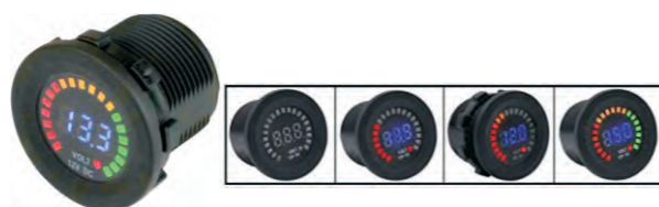
SF50798-12V/24V segmental display Volt. : (12V: 5~15V; 24V: 5~30V)