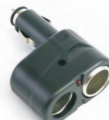
SF51928 Dual power outlet with led