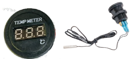
SF51886 Temp.Meter Measuring range: -40~120°C with Temp. sensor