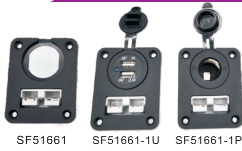
SF51661 SF51661-1U SF51661-1P