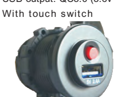
SF50896 Output:5V/2.4A MAX With switch