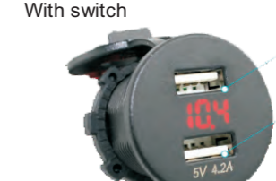
SF50797-R Output: 5V/4.2A totally with Voltmeter