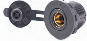
SF50880 Merit socket