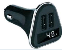
SF50902 2port USB Charger with LED digital display Input voltage: DC 12-24V Output: DC5V /4.8A total