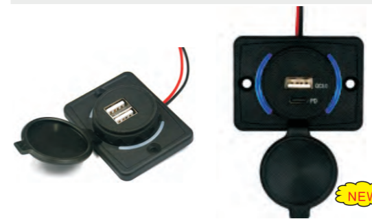
Flat USB panel size: 63.7*47.8*18.1mm