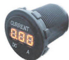
SF50793 Ammeter Measuring range: 0~10A