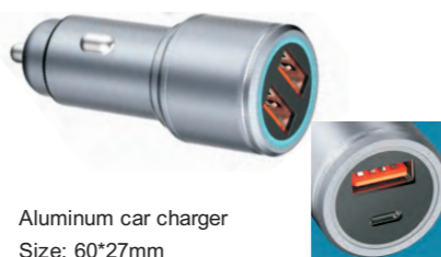
Aluminum car charger Size: 60*27mm