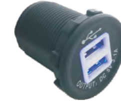
SF50884 Output: 5V/3.1A totally