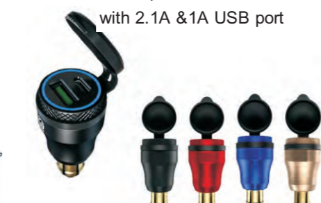
Dual USB charger, merit type 7075 aluminum alloy housing SF CODE output Housing Color choice SF51133 QC3.0 & TYPE C Golden/blue/black/red