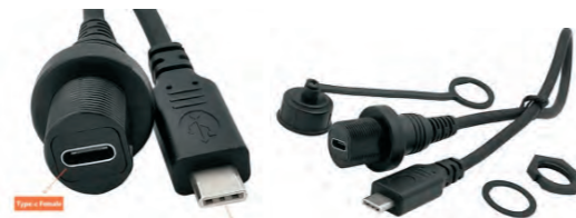
Type-c Male to Female AUX Flush Panel Mount Extension Cable for Car Truck Boat Motorcycle Dashboard ;

USB not included, you may choose from our USB series