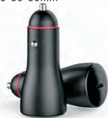
SF50978 PD65W Single portusb charger Aluminum housing