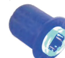
SF50796 Output: 5V 4.8A