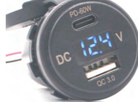
SF51910 Dual PD60W USB SF51910WP Dual PD60W USB with waterproof connector