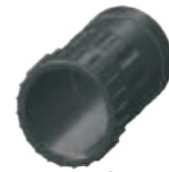
SF-BS24 Cylinder Quick Nut