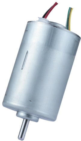
DIRECTION OF ROTATION